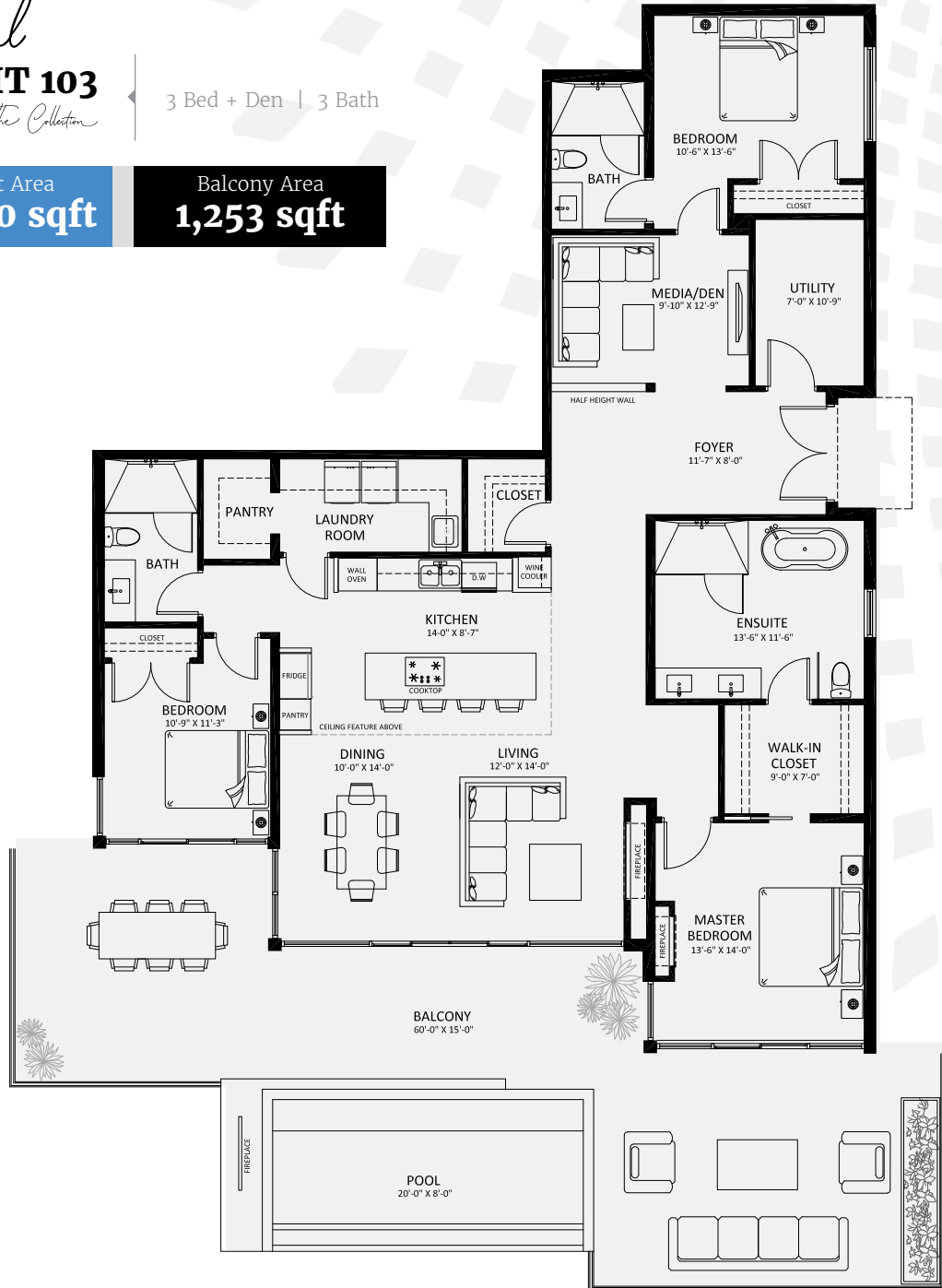
Image shown is an artist's conceptual rendering only. Conceptual renderings may not reflect the final product. The developer reserves the right to modify these designs without notice. The Developer reserves the right to make modifications to the product design, pricing and specifications without notice. Square footages are approximate and may vary E & O.E.