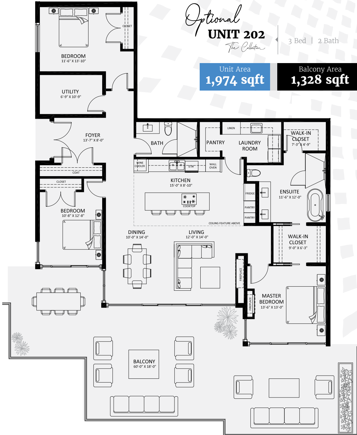
Image shown is an artist's conceptual rendering only. Conceptual renderings may not reflect the final product. The developer reserves the right to modify these designs without notice. The Developer reserves the right to make modifications to the product design, pricing and specifications without notice. Square footages are approximate and may vary E & O.E.