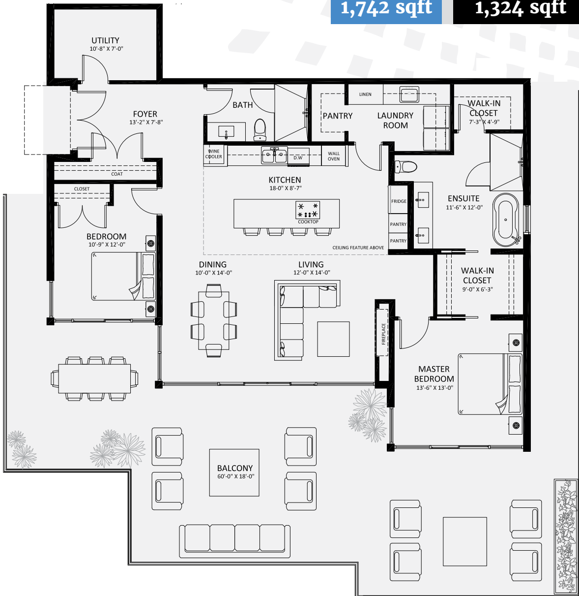
Image shown is an artist's conceptual rendering only. Conceptual renderings may not reflect the final product. The developer reserves the right to modify these designs without notice. The Developer reserves the right to make modifications to the product design, pricing and specifications without notice. Square footages are approximate and may vary E & O.E.